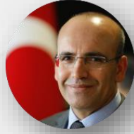
Mehmet ŐİMŐEK ( According to their approbation ) Minister, Ministry of Treasury and Finance of The Republic of Tũrkiye